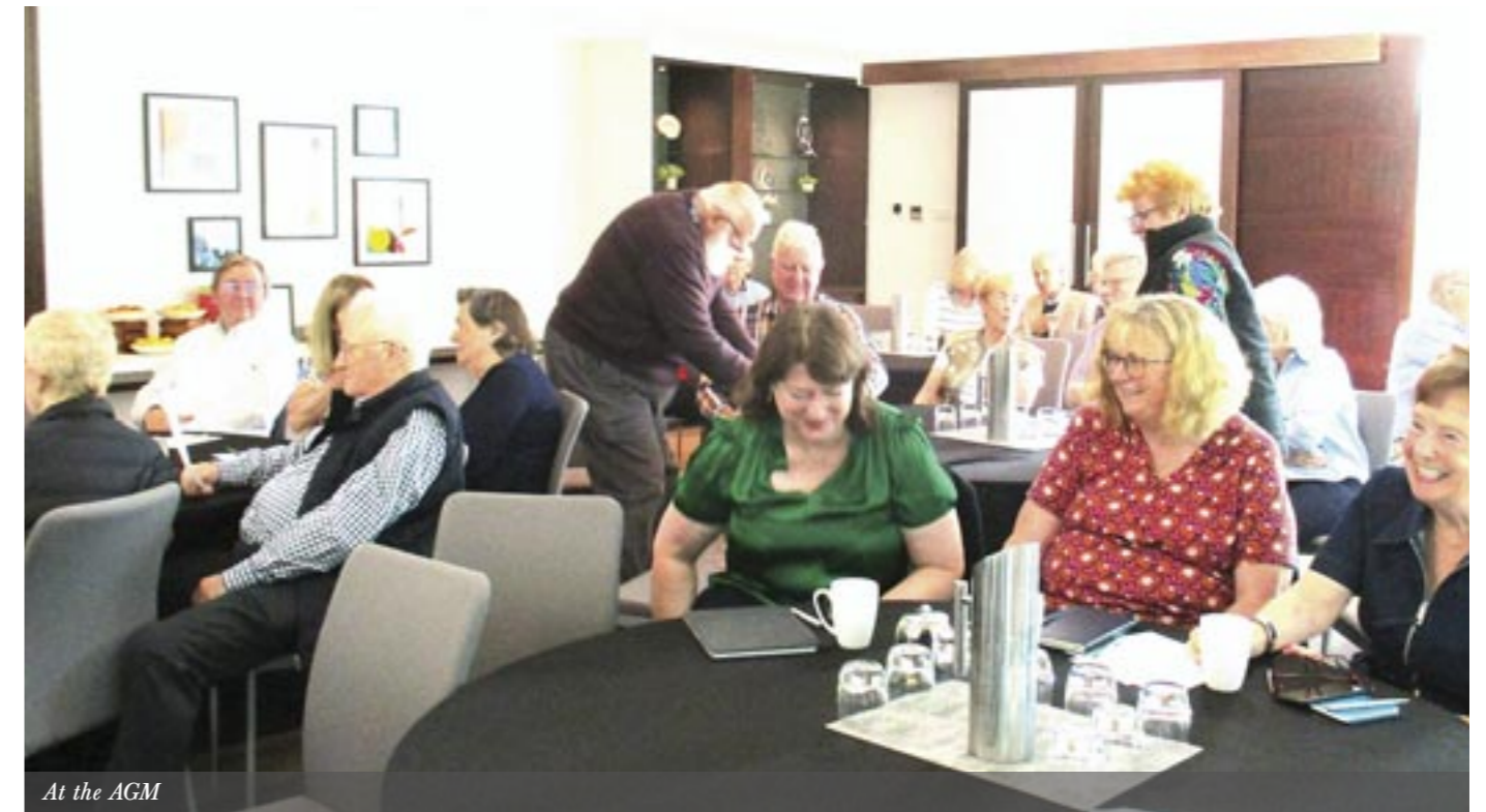
At the AGM