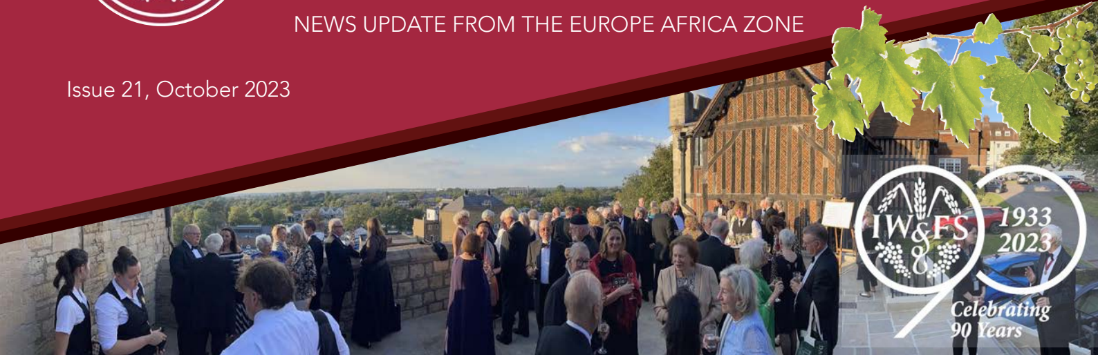
Windsor Castle drinks on the terrace