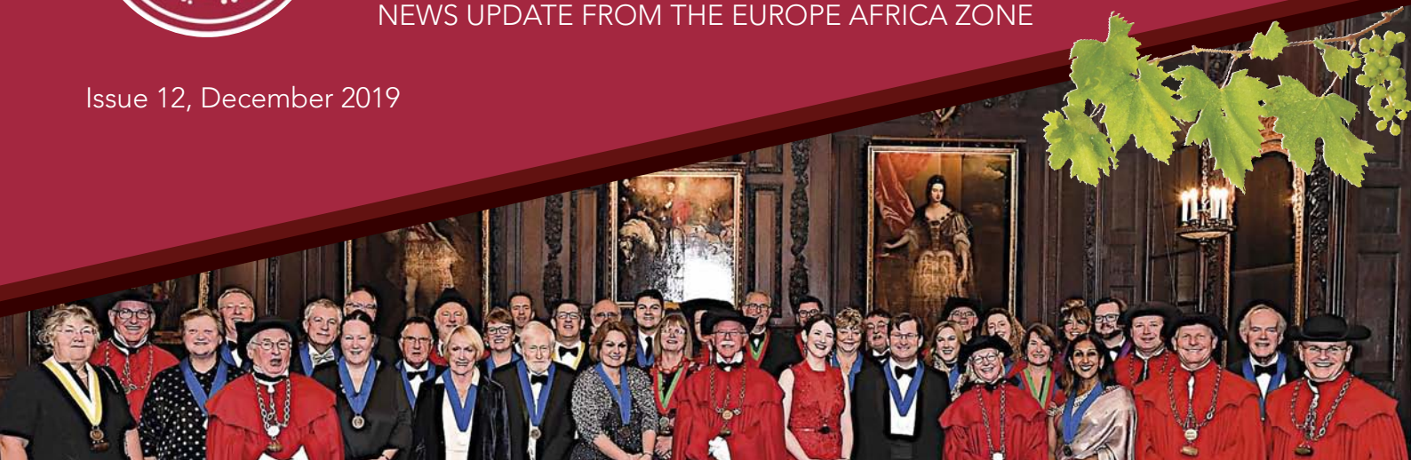
Alsace photo