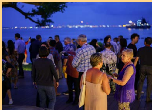
Opening night on 16 September 2022 on Santosa Island