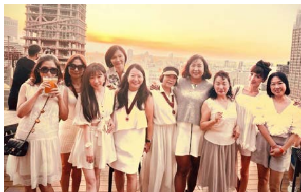
Above- Group photo at Hooters