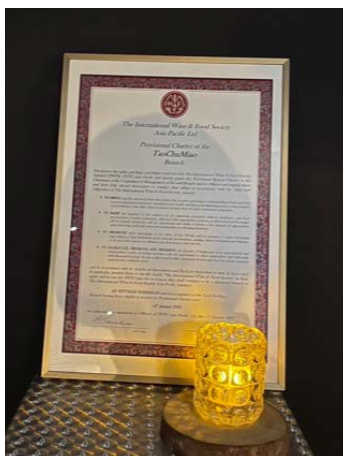
TaoChuMiao Branch Provisional Charter