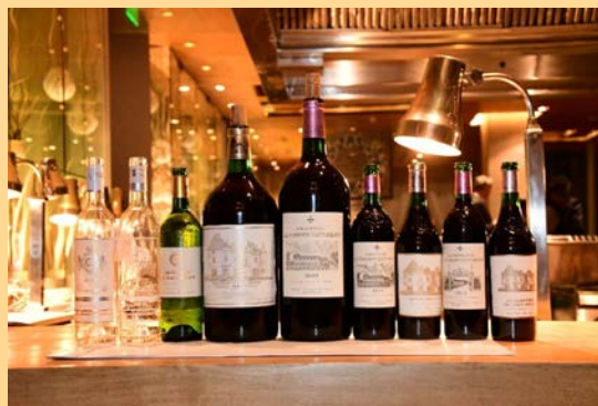
Chateau Haut Brion + Chateau La Mission Brion