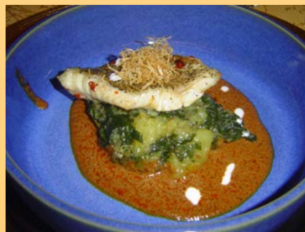
"Goan Fish Curry with Fenugreek Potatoes"