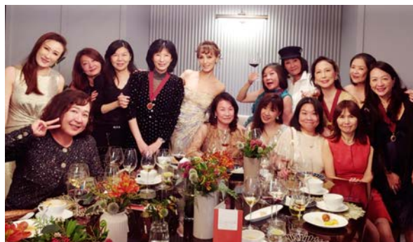
Below - Dinner at Clover Bellavita