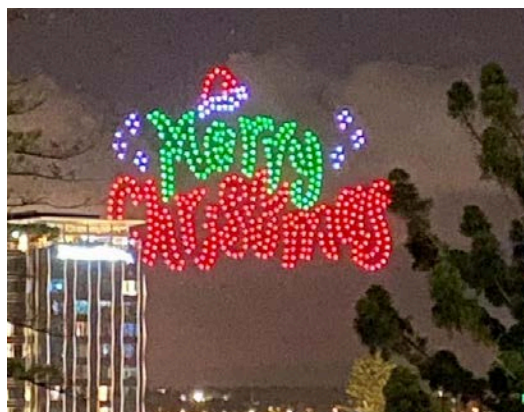
Perth Christmas Sky Drone Light Show 2022