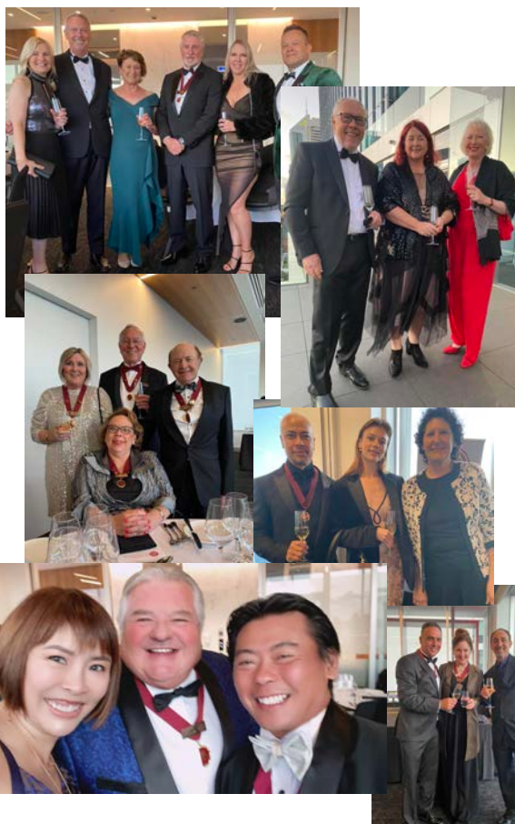
WA members celebrating at ANZAC House