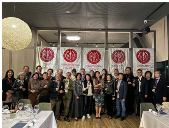
2022 End of Year Dinner for Taiwan Branches