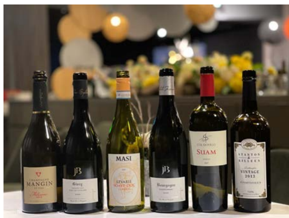
Pair Wines for the Celebratory Dinner