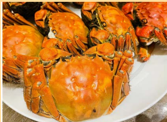
Hairy Crab Feast

Jazzed up with the best contemporary Christmas songs, and a real Christmas tree, those who attended were furthered pampered by traditional festive dishes. This included the most sumptuous of lamb racks and Ricky's own brew of spiced mulled wine. By the time everyone realised that the champagne and wine bottles ran dry, it was way past midnight!