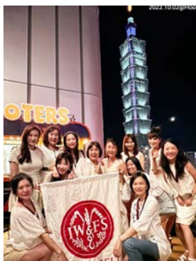
Taipei 101 in the backdrop