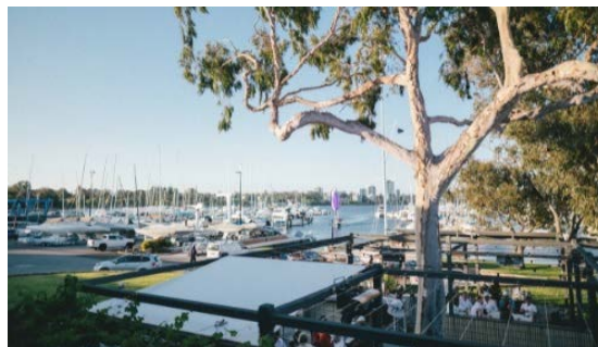
View from the Royal Perth Yacht Club