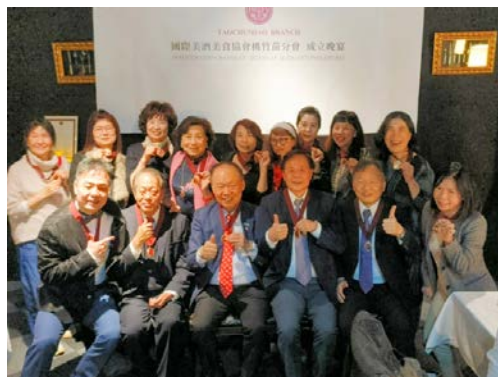
TaoChuMiao Branch Members

“TaoChuMiao” is short for the 3 cities between Taipei (north of Taiwan) and Taichung (middle of Taiwan): Taoyuan, Hsinchu and Miaoli. The branch is located in Hsinchu city and is renowned for the world famous Taiwanese semiconductor industry in the HsinchuTech Park, as well as for its local cuisine and its delicate Hakka cuisine of high quality. We look forward to hearing about their activities in the next newsletter. Congratulations.