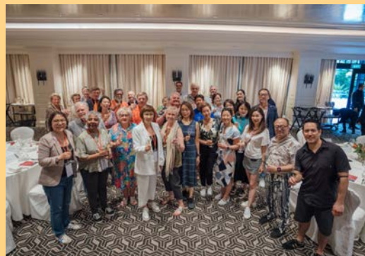
Group Photo at the Raffles Hotel on 17 September 2022