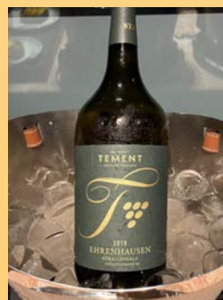
and the other half, Tement Ehrenhausen Sauvignon Blanc<Korallenkalk> 2019.