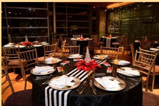
Four Seasons Hotel

We decanted into bottles, sing the same pipe, 30 minutes prior to service and then poured into glasses from the bottles. The 1980 Haut Brion stole the show in the Double Mags face-off and in the case of the younger 100-pointers, it was La Mission Haut Brion that won the majority vote.