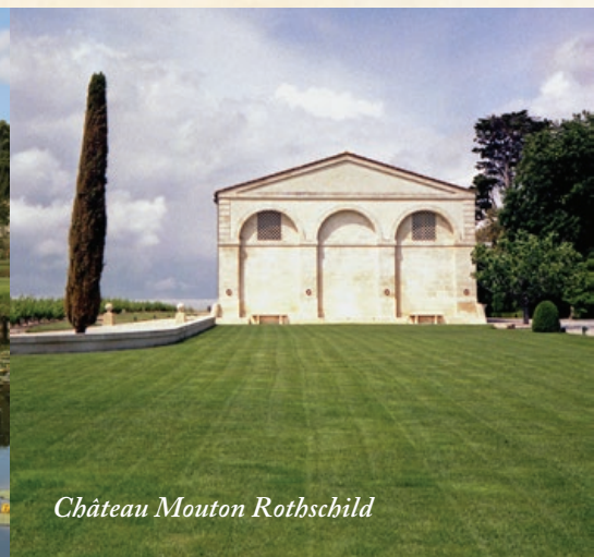
Château Mouton Rothschild