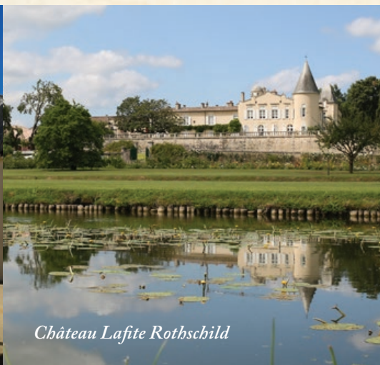
Château Lafite Rothschild