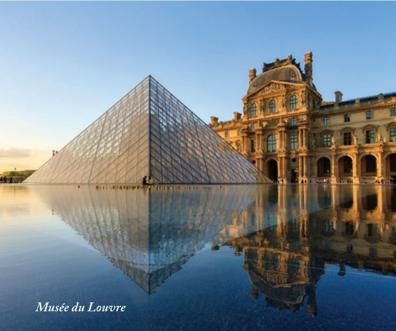
Musée du Louvre