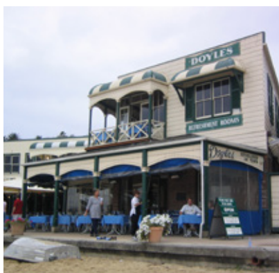
Doyles at Watson's Bay

If you are heading that way soon, maybe even for the Sydney pre-tour next month, you might want to keep them in mind.