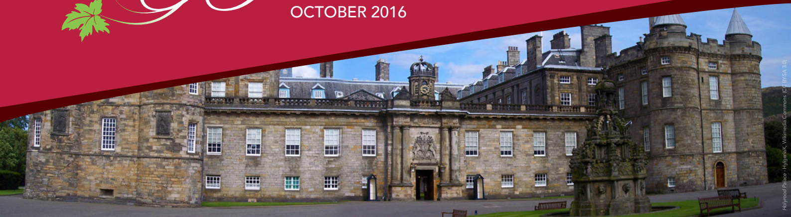
Holyrood Palace - Hygeia & Winemakers Commons CC BY-SA 4.0