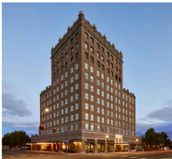
Marcus Whitman Hotel