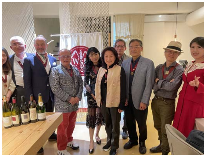
Taipei Branch Dinner at The One Zhongshan