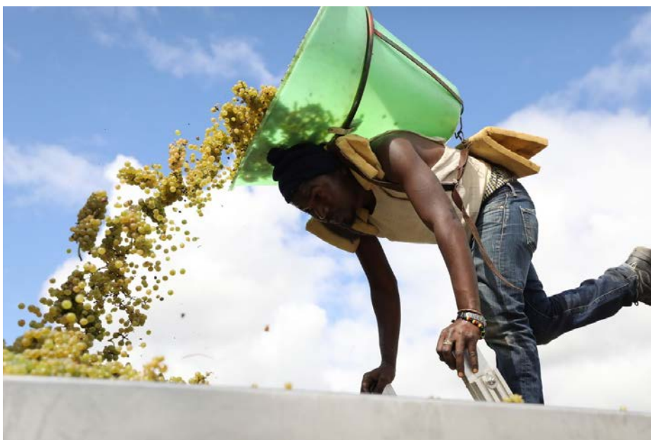
Emptying the hod, 2018 harvest at Domaine Luneau-Papin