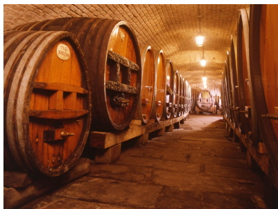
Wine Tour at Cave de Hospice

Enjoy the Strasbourg Hospices Wine tour and a LeGruber tasting followed by a walking tour of Le Petite France. We will taste four select wines at the Cave Hospice and 8 select wines at LeGruber. Shopping and lunch on your own in La Petite France or go back to the ship for lunch and relaxation.