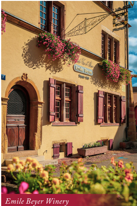
Emile Beyer Winery