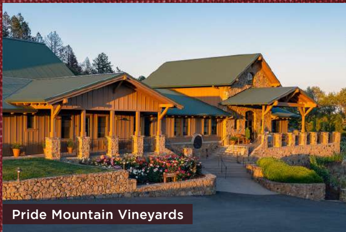
Pride Mountain Vineyards