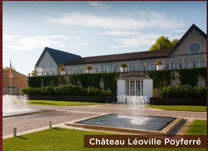
Château Léoville Poyferré