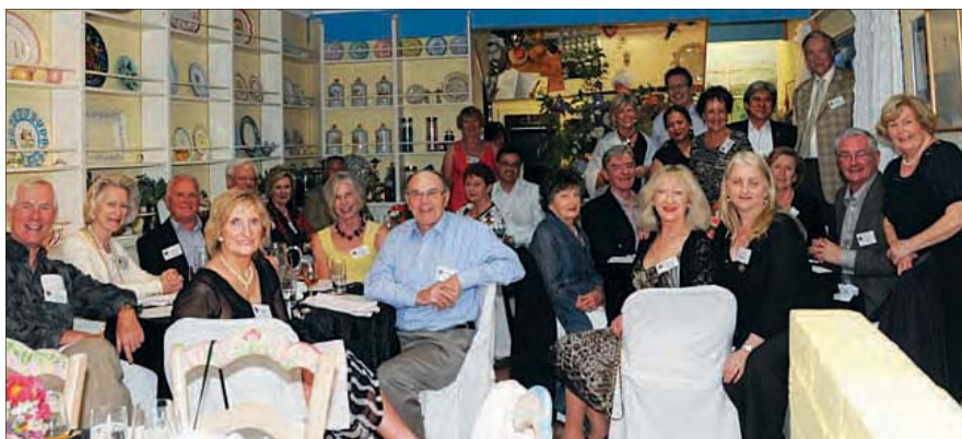
Victoria Branch members with our international guests – group shot

had a great chance to get to know one another. We all felt greatly privileged to have shared in such a wonderful evening of food, wine, and old and new friends.