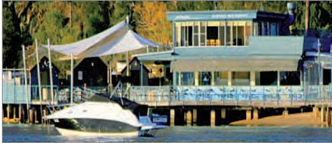
The Pier Restaurant, Batemans Bay

That evening we had our driver take us to the next town being Batemans Bay and we ate at the Pier Restaurant. This is a venue specializing in seafood and while it is rated by Saveur magazine as an awarded regional restaurant, we thought it was not up to the mark though its location is impressive.