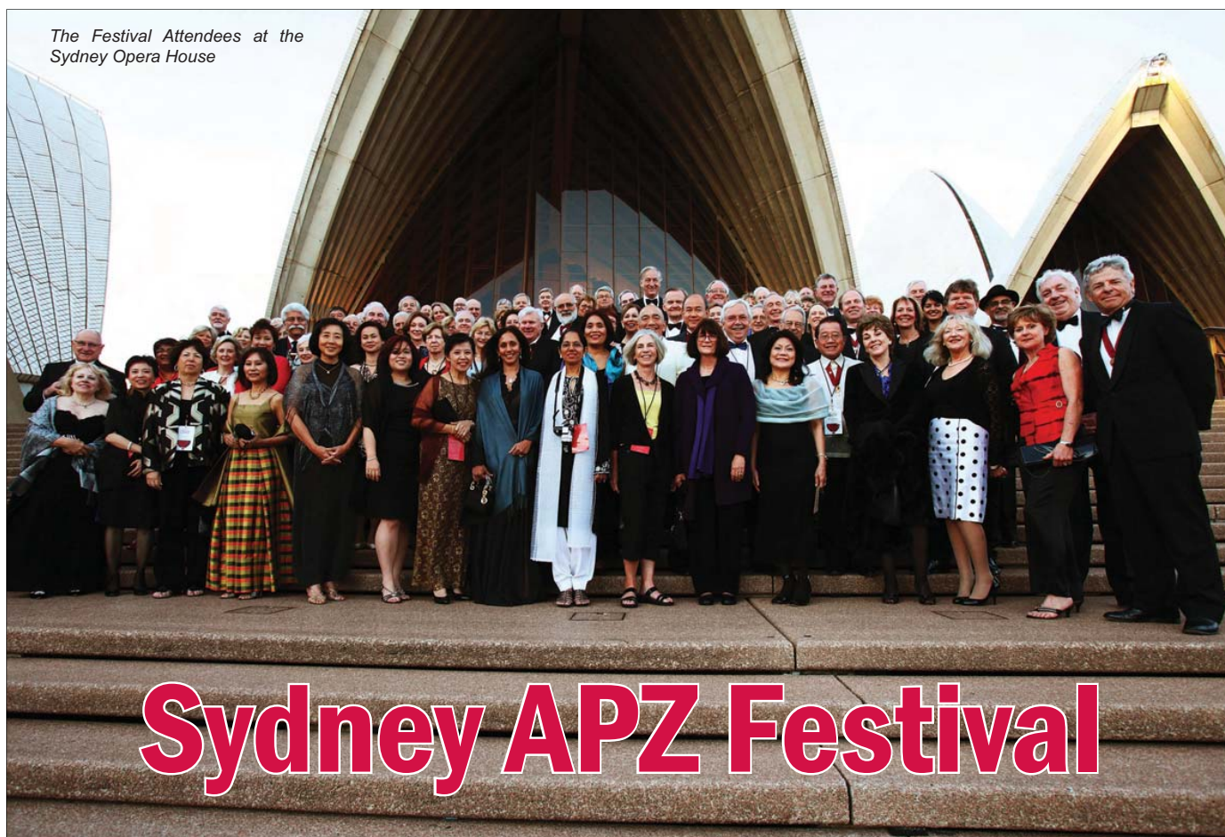
The Festival Attendees at the Sydney Opera House