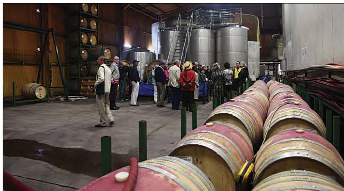
At McWilliams Wines