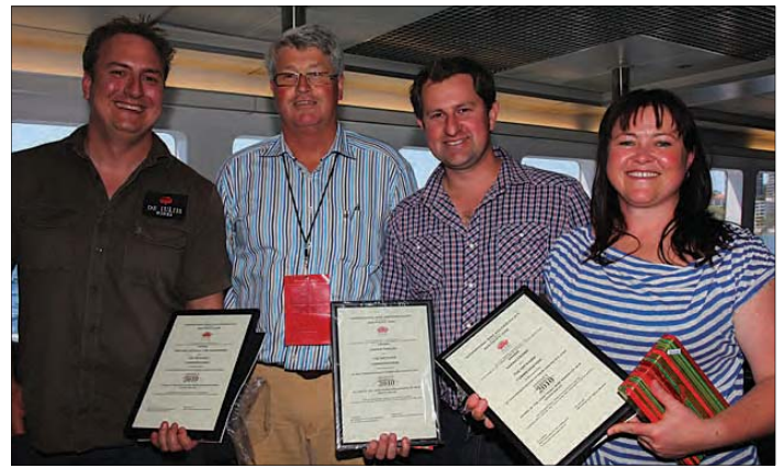
Winemakers from the Hunter Valley with the Chairman