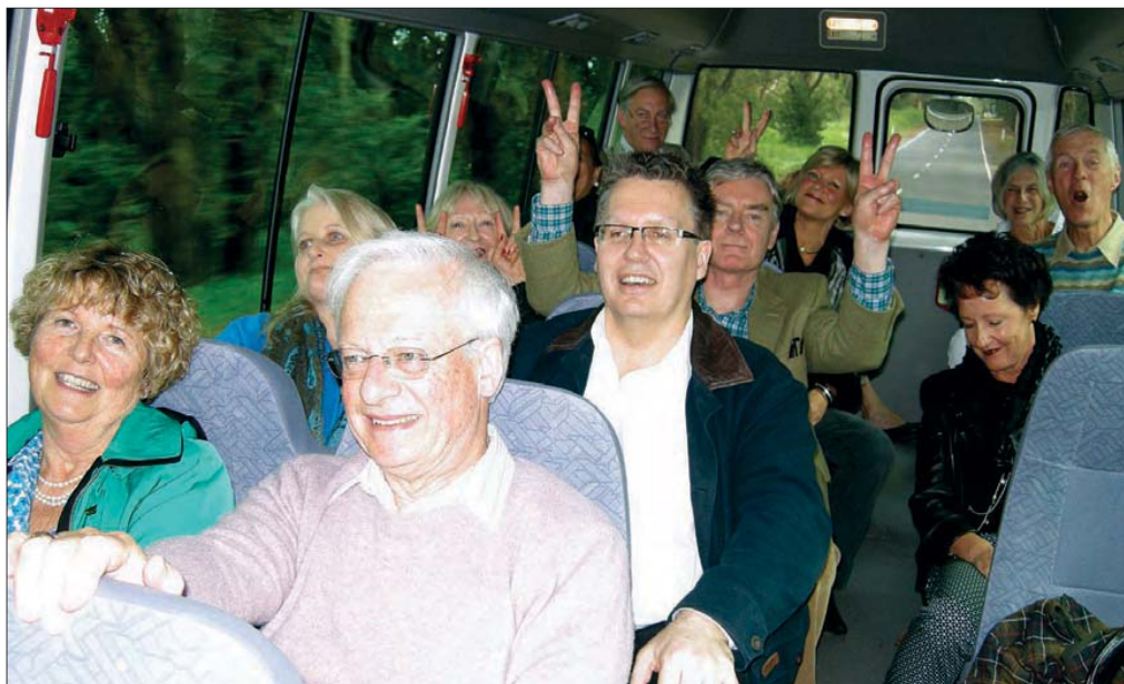
On board our bus for the Mornington Peninsula experience

After our tasting at Hurley Vineyard, we climbed back into our bus and travelled to Main Ridge, 15 minutes away, to enjoy a quick tasting followed by lunch at Ten Minutes by Tractor. Ten Minutes by Tractor is another Pinot producer on the Peninsula, named 10MXT as the three vineyards which are owned by this producer can be reached within ten minutes from one another by tractor. 10MXT also operates the classiest restaurant on the Peninsula so we simply had to present their degustation menu to our guests.