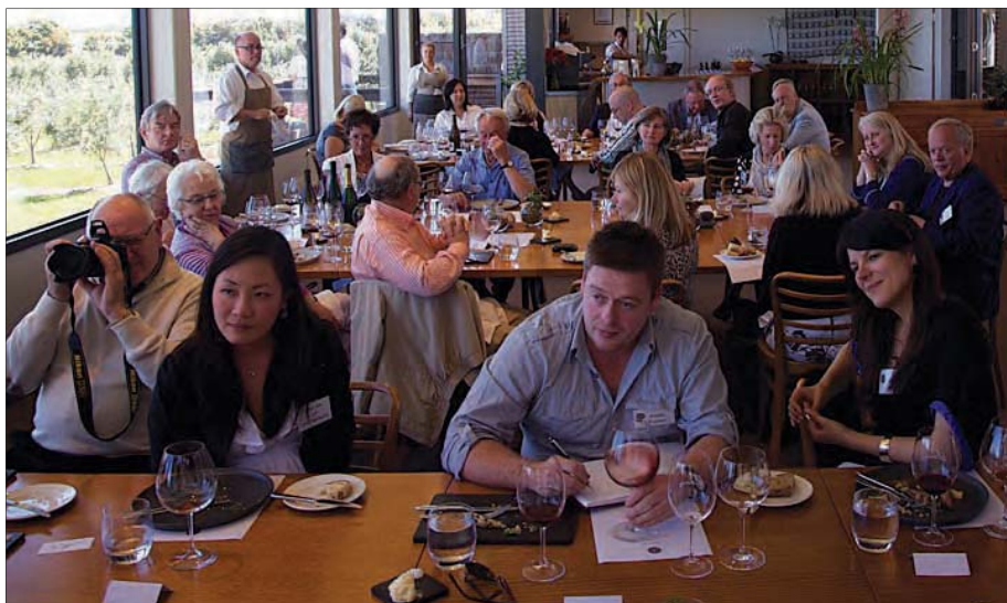
Members listening closely to discussion on the Pinots