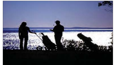
We stayed the night at Mollymook Beach (Ulladulla) opposite the beach golf course.