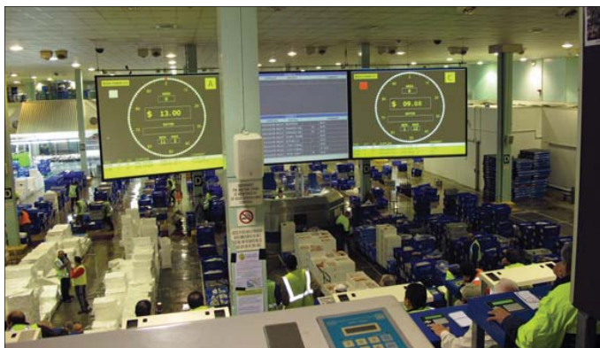
The Reverse Auction at the Sydney Fish Market

On the way to Pilu Restaurant at Freshwater Beach for lunch, we were taken for some sightseeing around the coastline just north of the harbour near Manly at Sydney's Middle Head and North Head. Strong and gusty wind and rain deterred many from disembarking from the buses while those who attempted went on to Pilu having either been soaked or having enjoyed the spectacle.