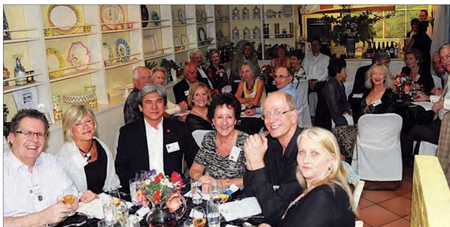
Victoria Branch members with our international guests – at our tables

We matched our first entrée, an outstanding mushroom consommé with a mushroom ragout, with really delicate but intense flavours, with an aged Clouet Rose Champagne – a divine dish and a match made in heaven.