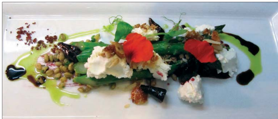
A very special dish of asparagus and goats cheese to start