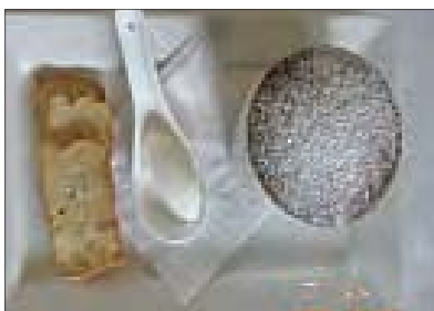
Some of the dishes at Eschalot